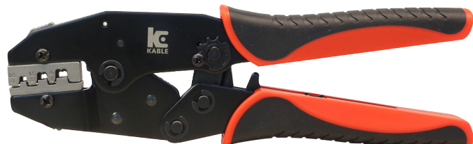
KC-6IC For Open Barrel Terminal AWG 20-18/16-14/12-10 0.5-1.0/1.5-2.5/4.0-6.0 mm 2