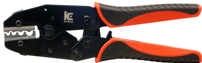
KC-6IB For Non-Insulated Terminal AWG 20-18/16-14/12-10/8 1.5/2.5/6.0/10 mm 2