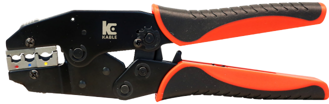
KC-6IA For Insulated Terminal AWG 22-18/16-14/12-10 0.5-1.0/1.5-2.5/4.0-6.0 mm 2