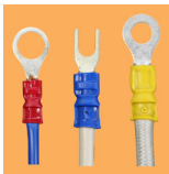
KC-8A For Insulated Terminal & Connector AWG 20-18/16-14/12-10 0.5-1.0/1.5-2.5/4.0-6.0 mm 2