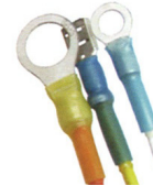
KC-8A1 For Insulated Terminal & Connector AWG 22-18/16-14/12-10/8 0.5-1.0/1.5-2.5/4.0-6.0/10 mm 2