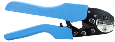
KC-8C448 For Non-Insulated Receptacle & Tab Terminal AWG 26/20/18/16/14 0.14/1.0/1.5/2.5 mm 2