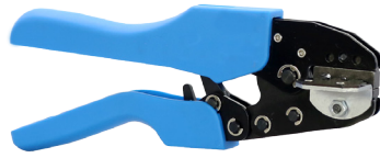
KC-8C63 For Non-Insulated Receptacle & Tab Terminal AWG 20-18/18-14/12-10 0.5-1.0/1.5-2.5/4.0-6.0 mm 2