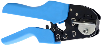
KC8C48 For Non-Insulated Receptacle & Tab Terminal AWG 20-18/18-14/12-10 0.5-1.0/1.5-2.5/4.0-6.0 mm 2