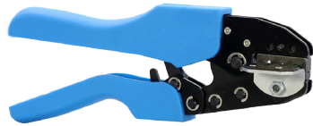
KC-8C63 For Non-Insulated Receptacle & Tab Terminal AWG 20-18/18-14/12-10 0.5-1.0/1.5-2.5/4.0-6.0 mm 2