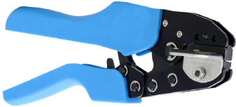
KC8C48 For Non-Insulated Receptacle & Tab Terminal AWG 20-18/18-14/12-10 0.5-1.0/1.5-2.5/4.0-6.0 mm 2