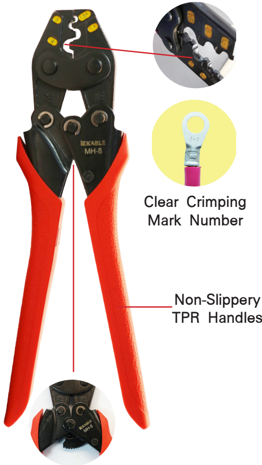
New Mechanism Design For Force-saving