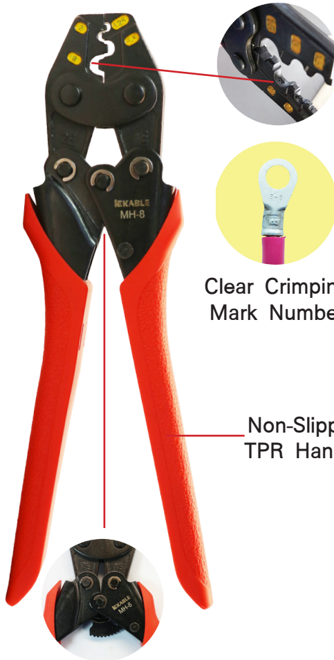
New Mechanism Design For Force-saving