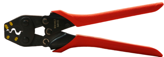
MH-8 For Non-Insulated Terminal