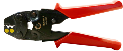
HS-1MA For Non-Insulated Terminal