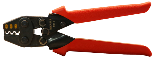
MH-5 For Non-Insulated Terminal