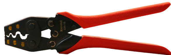
MH-16 For Non-Insulated Terminal