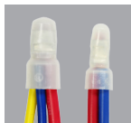
MH-125 For Close End Terminal