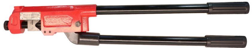
TM-150 Adjusting the top screw to change the crimping For Non-Insulated Terminal